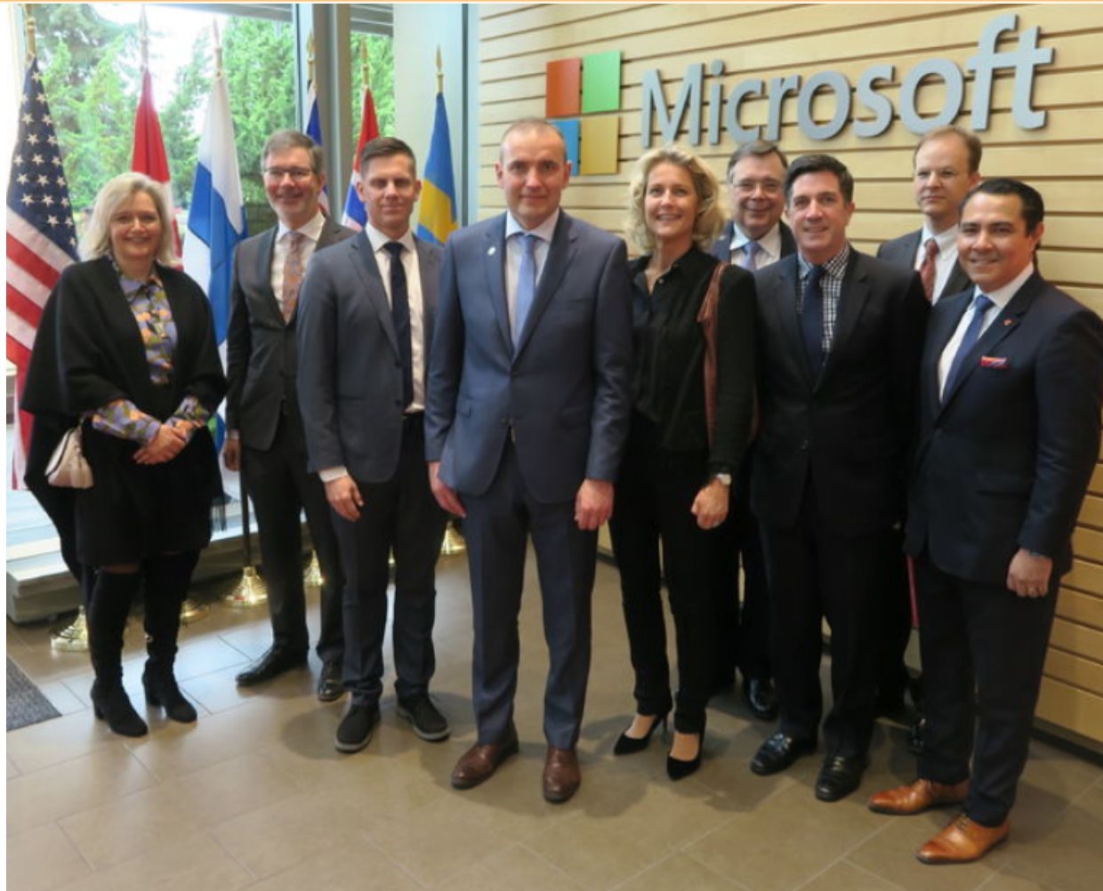
The President of Iceland visiting Microsoft headquarters