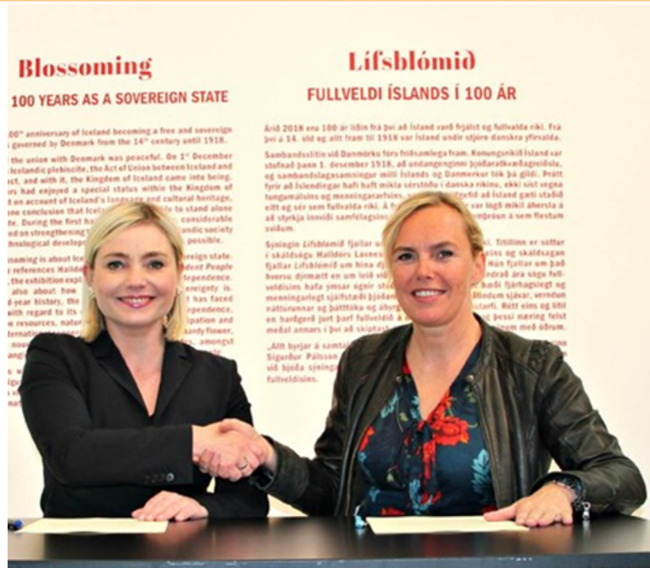
The Minister of Education, Science and Culture signing contract with Almannarómur, August 2018