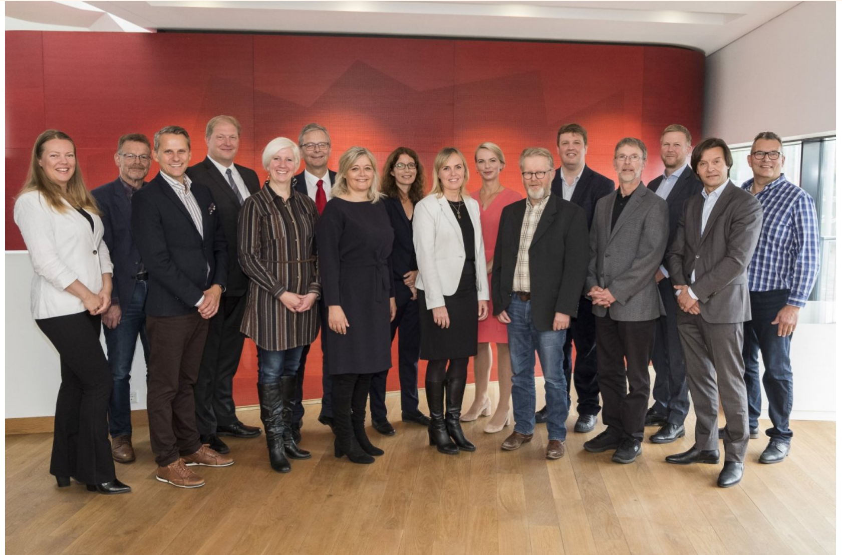
Almannarómur signing contract with the SÍM Consortium for Language Technology, September 2019