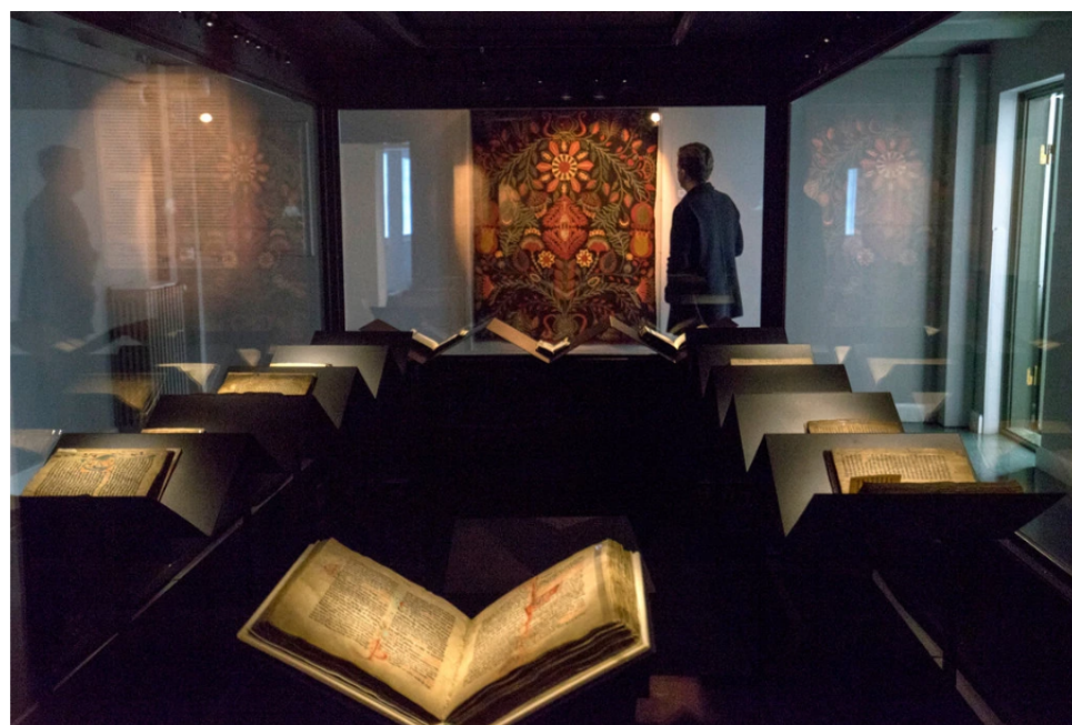
A law book written on calfskin in 1363 on display at a museum in Reykjavik, Iceland. Icelanders long prided themselves on reading epic tales written on the material, but their language is being undermined by the use of English.