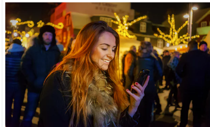
▲ Young Icelanders spend a large part of their lives in an almost entirely English digital world.

U nlike most languages, when Icelandic needs a new word it rarely imports one. Instead, enthusiasts coin a new term rooted in the tongue's ancient Norse past: a neologism that looks, sounds and behaves like Icelandic.