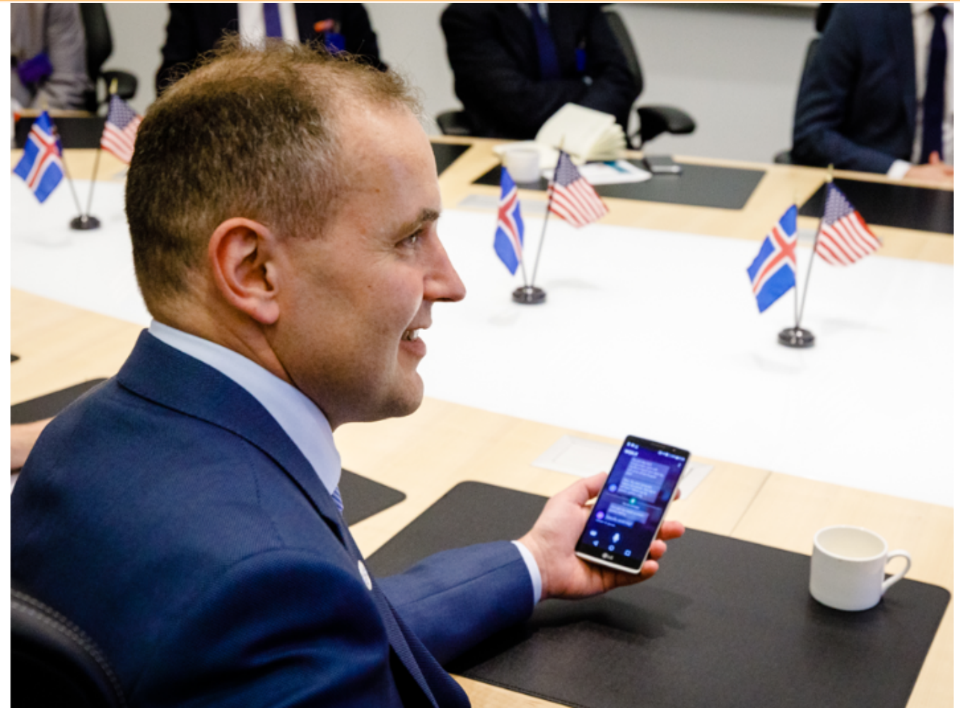
The President testing Icelandic on the Microsoft Translator app