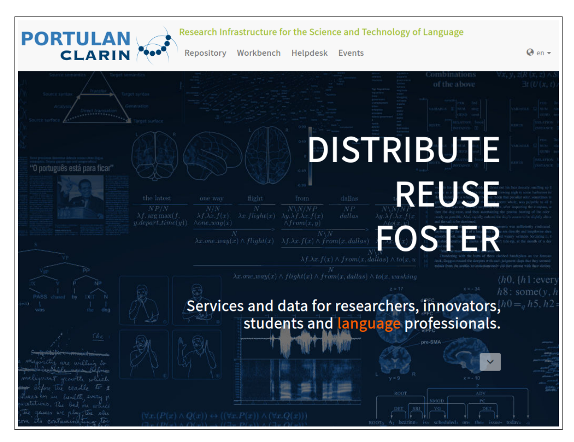
Figure 1: Front page of the PORTULAN CLARIN research infrastructure

guage Teaching and Promotion, Cultural Creativity, Cultural Heritage, etc.