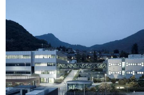
FBK – Trento, Italy